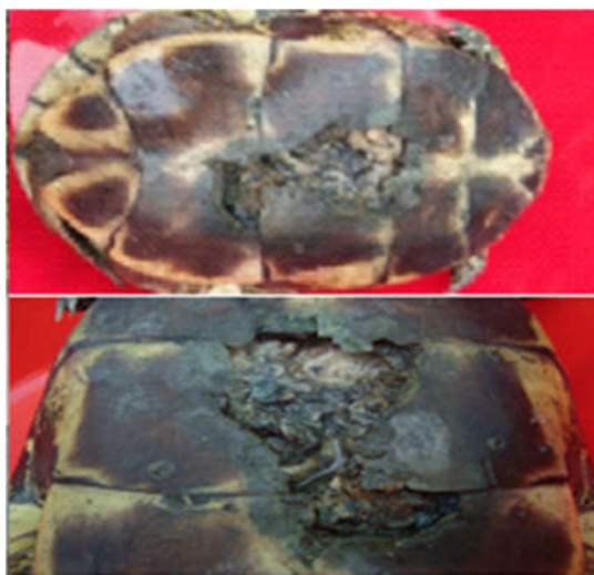
Figure 1. Caspian Turtle Mauremys caspica (Gmelin, 1774) East of Al-Hammar Marsh-Iraq showing Skin lesions.

All bacterial were isolated from Testudines' incubated at 37°C. The isolated species were Citrobacter freundii with probability of 29.06%, Klebsiella oxytoca (25.58%), Serratia fonticola (24.41%) and Enterobcter cloacae (20.41%) (Table 1). The data of bacteria are useful tool in understanding the role of bacteria as pathogenic agents in wild turtles.